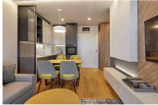
Apartments by Bor